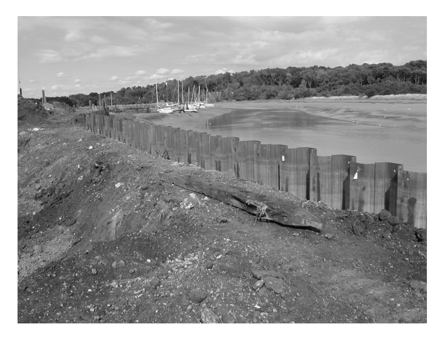
Fig 2 Timber post with new sheet piling to the rear - view north.