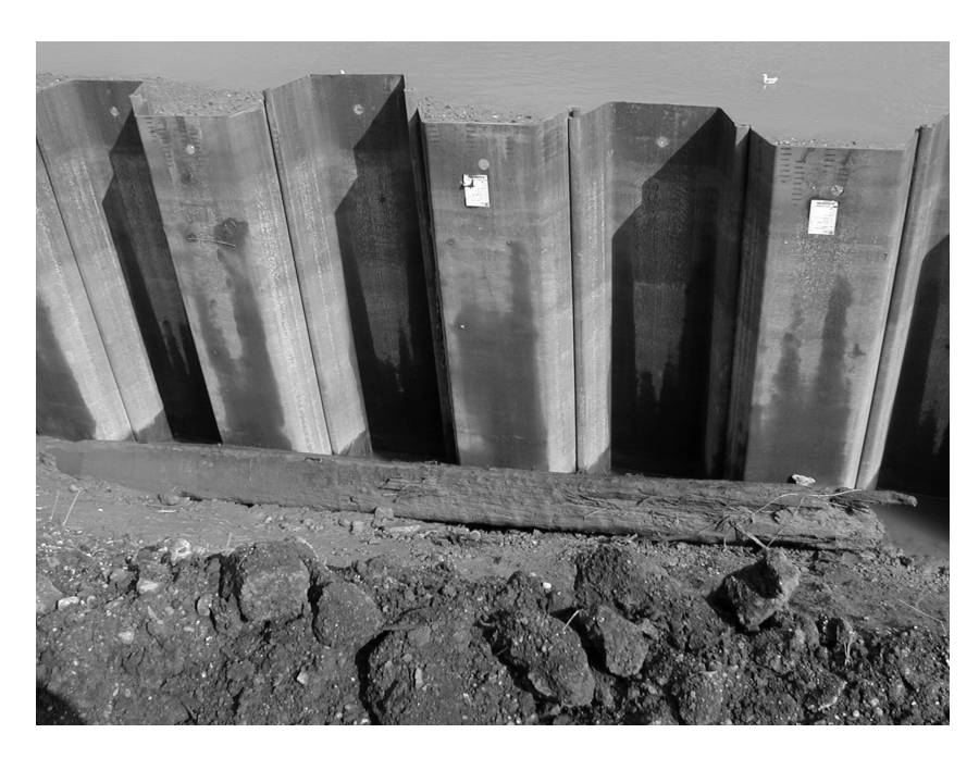
Fig 3 Timber post with new sheet piling behind.