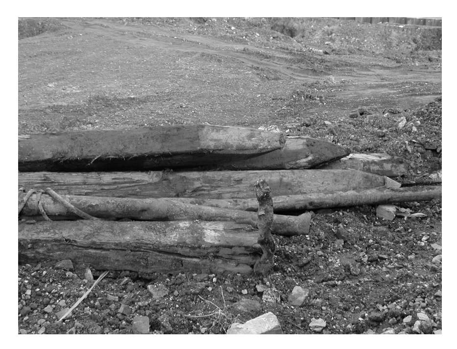
Fig 4 Timber posts.