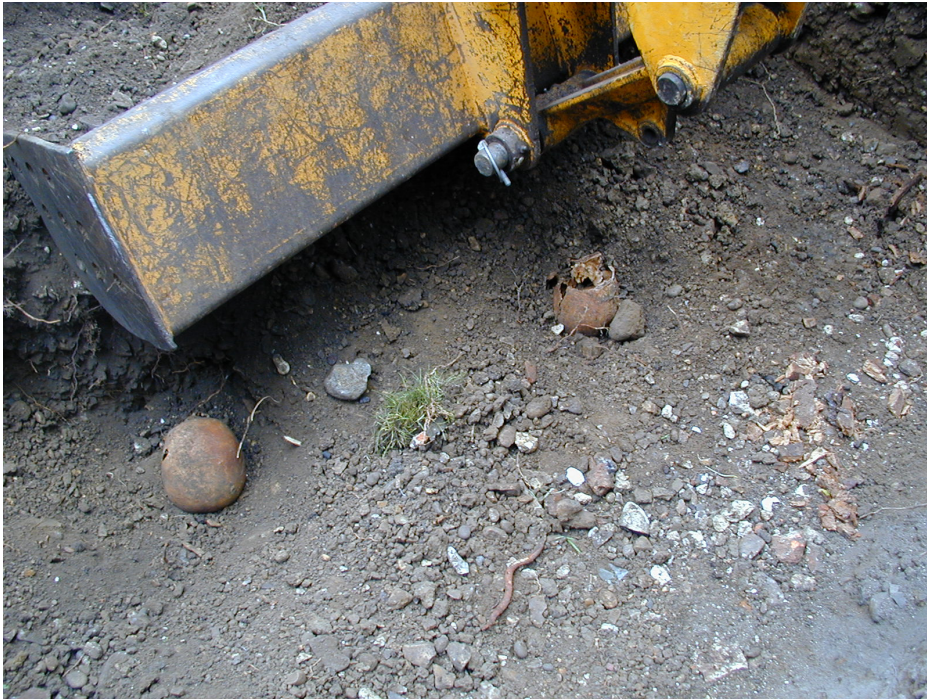
Plate 1 The two skulls from Soakaway 1, looking south.