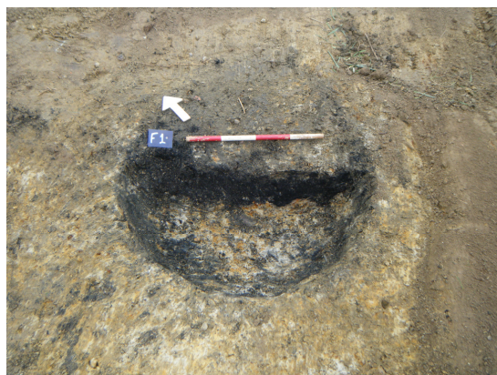
Plate 1 F1, shot facing north-west. Typical of undated burns pits uncovered during monitoring.