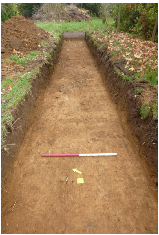
Plate 5 Trench 2 (view northeast)

Trench 2 (T2) was 13 m long and oriented southwest-northeast central within the footprint of the proposed new garage and outbuilding (Fig 1). No features of archaeological significance were located within this trench (Plate 5)., the base of which consisted of undisturbed natural (L4).