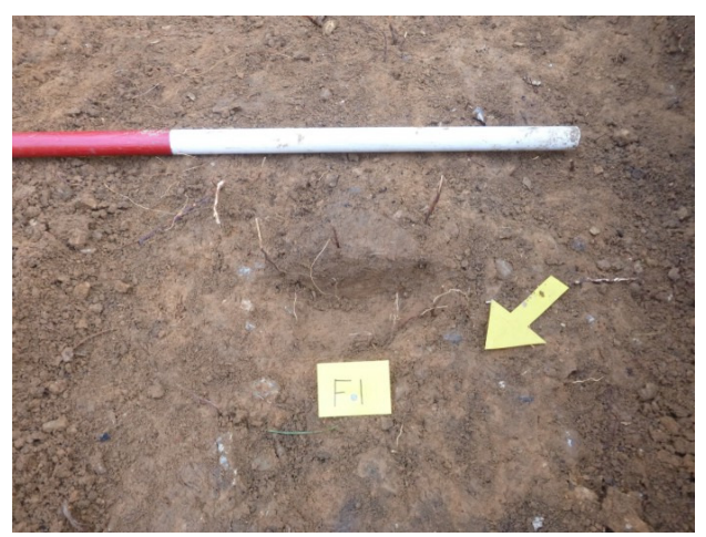
Plate 4 Feature F1 (view southeast)

A small, shallow feature (F1) cut into the natural (L4) was located approximately at the centre of Trench 1A at a distance of 3 m from its north end (Fig 1). A hand excavated half section of this feature (Plate 2) showed it to be filled with medium brown clay-silt but not finds were present within the excavated section. It is interpreted as the base of a possible post-hole, but is of uncertain date.