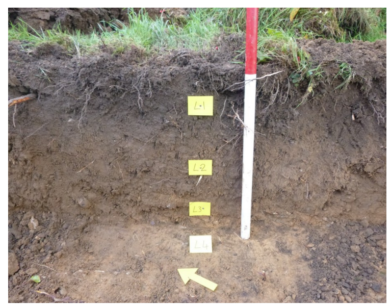
Plate 1 Representative trench section showing soil layers (L1-3) and natural (L4)