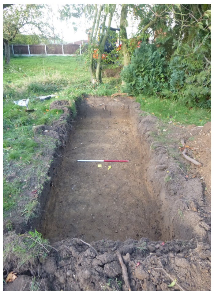
Plate 3 Trench 1B (view northwest)

A small, shallow feature (F1) cut into the natural (L4) was located approximately at the centre of Trench 1A at a distance of 3 m from its north end (Fig 1). A hand excavated half section of this feature (Plate 2) showed it to be filled with medium brown clay-silt but not finds were present within the excavated section. It is interpreted as the base of a possible post-hole, but is of uncertain date.