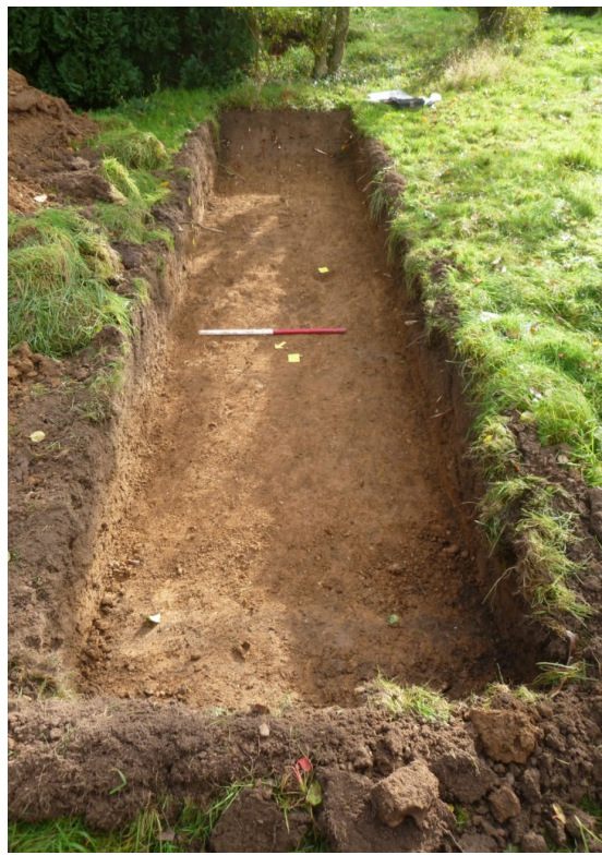
Plate 2 Trench 1A (view southeast)

Trench 1 (T1) was orientated nothwest-southeast central within the footprint of the proposed new house. It was planned as a single trench 13 m long (CAT 2014 fig 1). In the event T1 had to be divided into two smaller (shorter) trenches Trench 1A & Trench 1B (Fig 1). These were separated by a 3.5 m break either side of an extant line of small trees T1A (Plate 2) & T1B (Plate 3). T1A was 6.5 m long and T1B 5.5 m (total length 12 m).