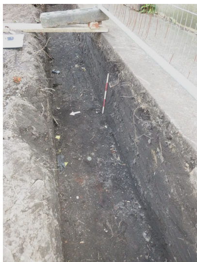
Plate 1 Dark soil towards the eastern end of the footing trench, view south-east

Three modern services were identified along with a pit (F1), approximately 1m wide, visible in the eastern half of the foundation trench. Finds from the pit were not retained but included post-medieval brick, peg-tile, glass and pottery. There was no indication that this pit dated to earlier than the post-medieval or modern period.