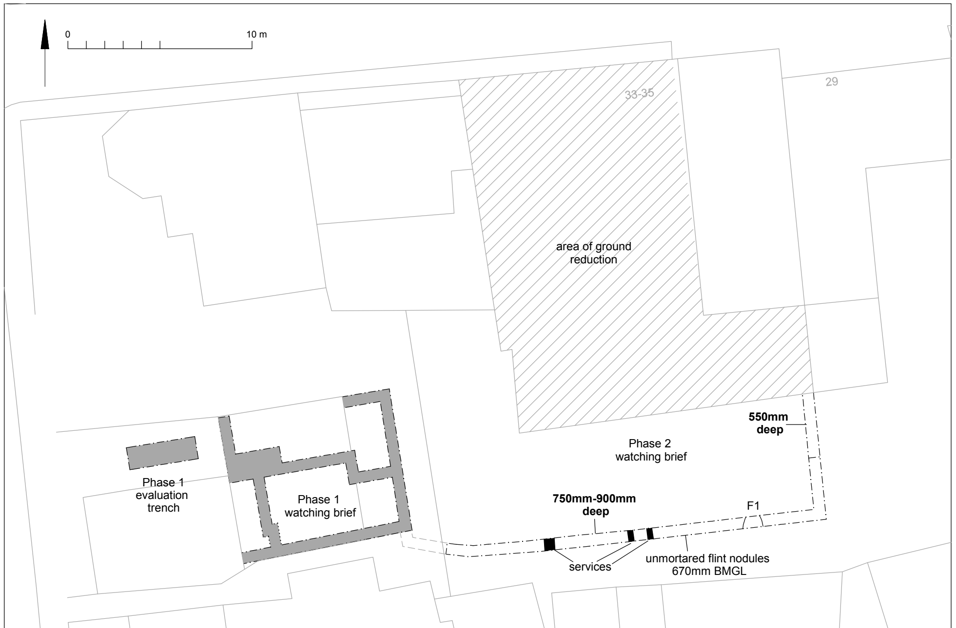
Fig 2 Results.