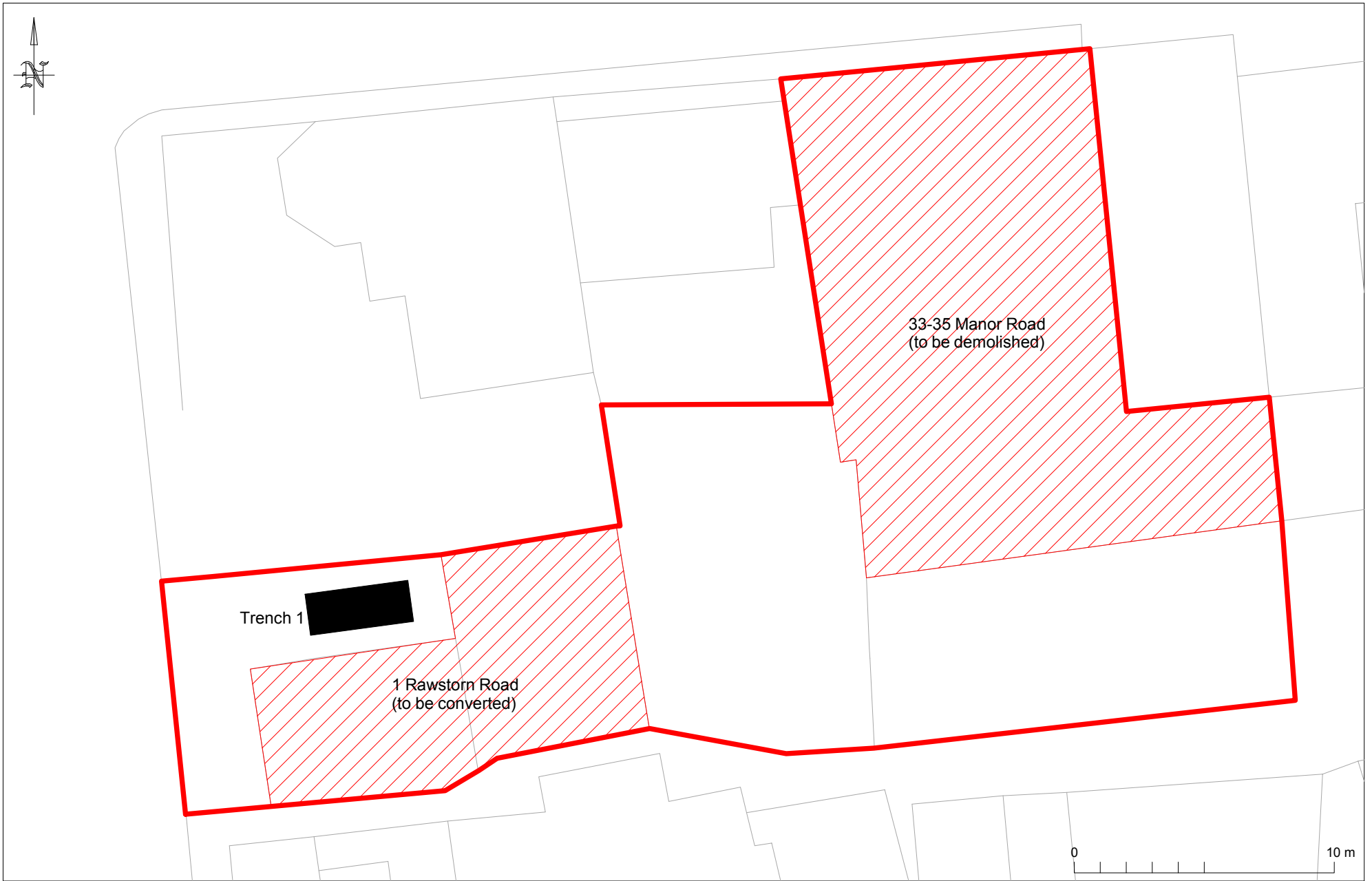
Fig 2 Trench location