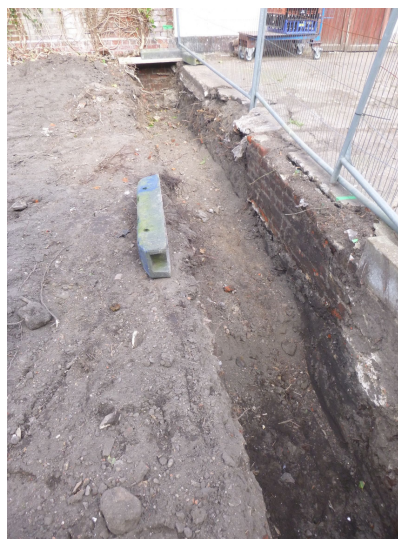
Plate 2 The shallow N-S stretch of the footings trench, view north-east