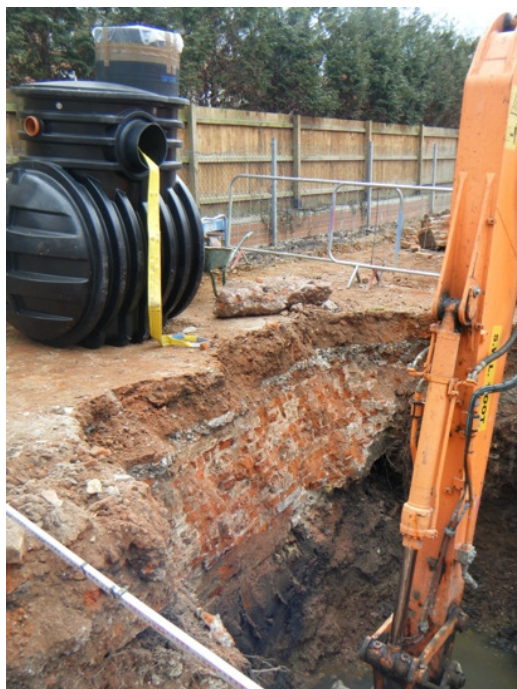
Plate 1: silk mill footings exposed in storm drain intercept in NE site corner.

Drainage renewal took place in two parts of the site - the NE and SW corners. The work involved the installation of new intercept manholes and foul and storm water runs. Both manholes (5x5m) were excavated to a formation level of 2.7m bgl. Made ground (L3 in evaluation) was observed to a depth of 1.3m bgl, sealing alluvial deposits (river silts). Natural river gravels were observed a depth of 2m bgl, and ground water at 2.5m. No archaeological deposits or material was recovered from the manhole excavations, however a substantial foundation was seen in the east edge of the NE excavation. The foundation was 19th-century, and although not part of the silk mill itself represents one of a range of associated ancillary buildings on the eastern edge of the complex (the engine shed or the fuel store). New drainage runs were excavated to a maximum formation level of 1.1m bgl into made ground (L3).