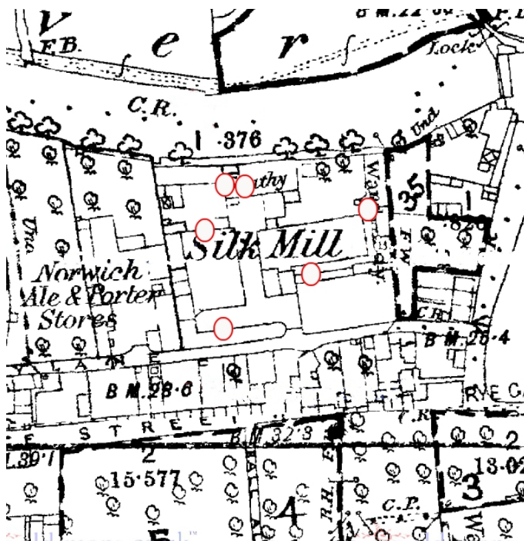
Plate 2: extract from OS of 1875, showing Brown's Silk Mill. The red ellipses mark the approximate positions of brick footings associated with the mill, as intercepted by 2009 and 2013 evaluations, and 2015 watching brief.

The silk mill is shown on the 1875 OS map Plate 2, below).