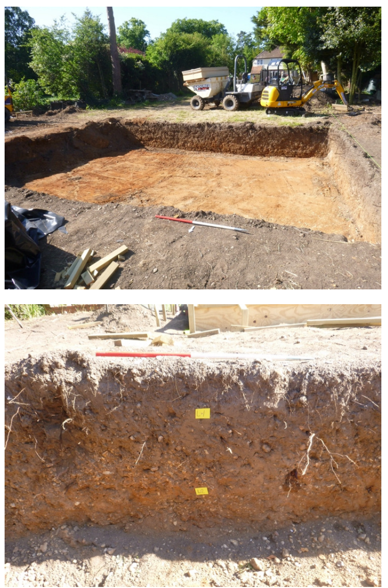
Plates 1 and 2 : the pool excavation (view south towards house) and section, showing typical soil conditions on this site (1m scale).

The swimming pool, close the north property boundary, measured 6 x 4m and was excavated to a formation level of 1m bgl through modern topsoil (L1: 15cm thick), accumulation horizon (L2: 38 - 40cm thick) into natural geological horizons (L3). No archaeological features were seen, nor were there any finds.