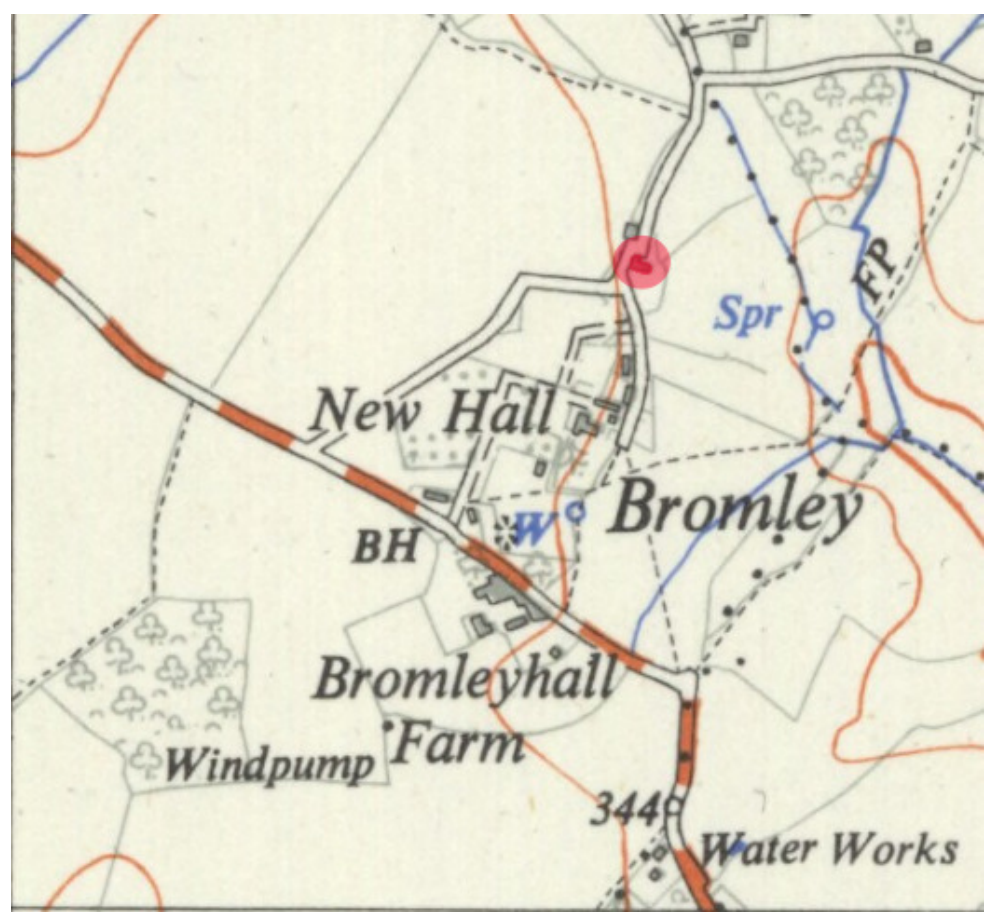
Map I 1951 OS map. Previous building on site highlighted in red.