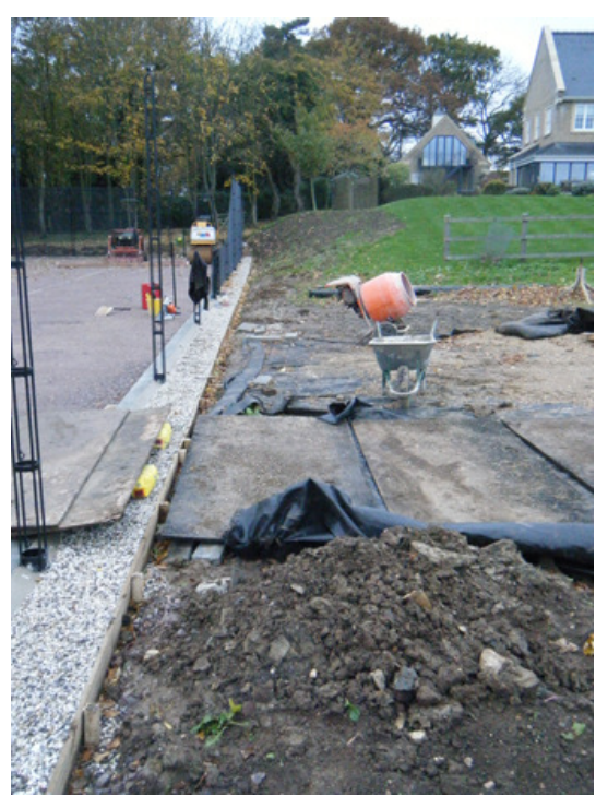
Photograph II Side of tennis court after fence-posts erected. Upcast visible by each post. Shot taken facing west.

The examination of the upcast material from the fence-posts yielded nothing except for more fragments of modern brick and slate ( Photograph II ).