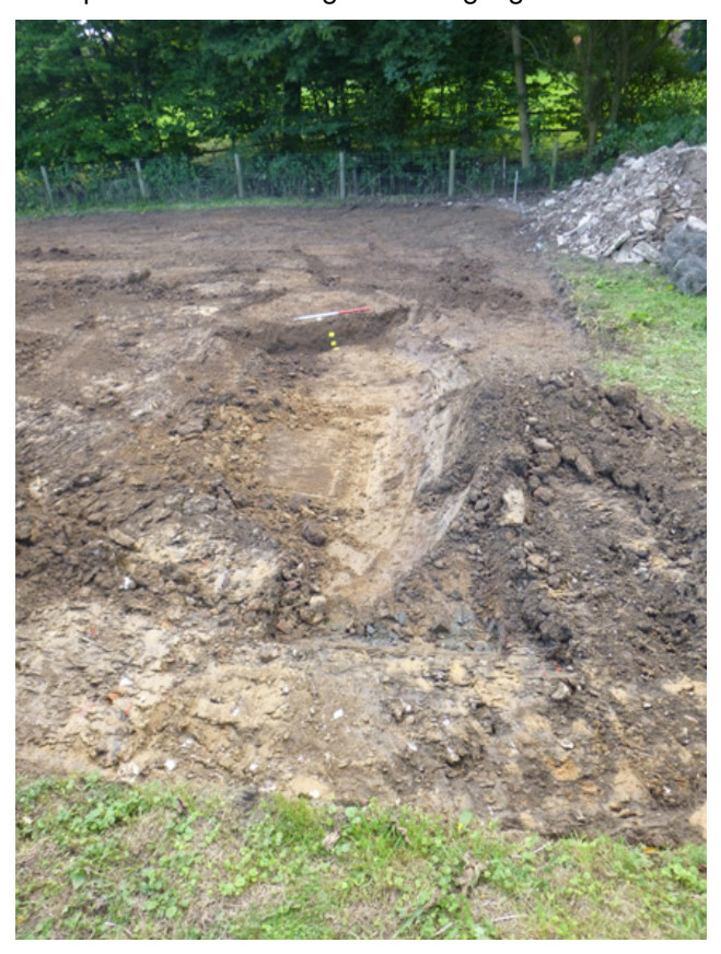
Photograph III Site shot taken facing south. Small section of exposed natural clay (L4) visible in centre frame.