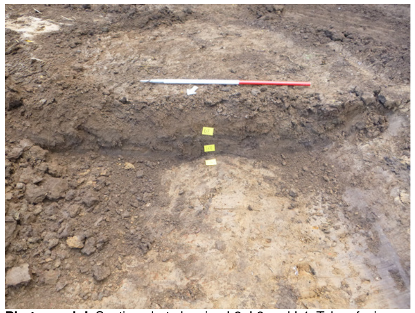
Photograph I Section shot showing L2, L3 and L4. Taken facing south-east.

The strip was carried out in two phases. First the topsoil (L1) was removed over the entire site, then the remaining layers were excavated down to the required formation level of the tennis court.