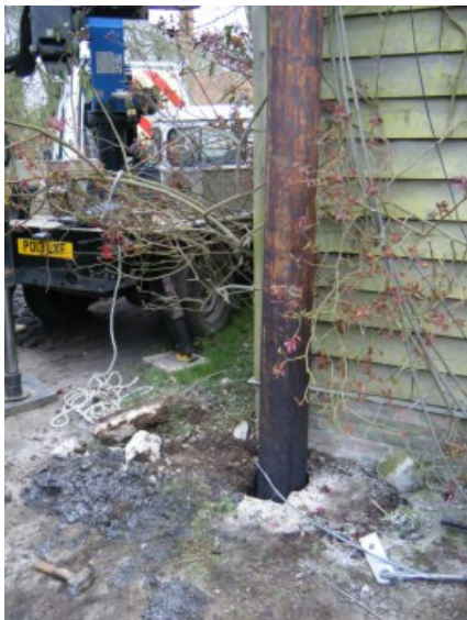
Photograph 3 Replacement electricity pole placed into the hole created by the removal of the original pole.