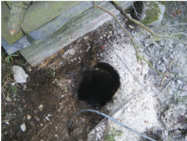
Photograph 2 Hole created after removal of existing electricity pole.