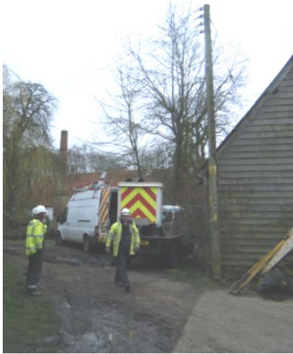
Photograph 1 Before existing electricity pole removed.