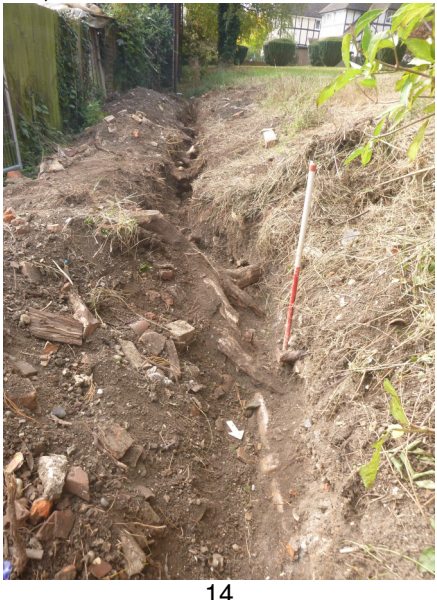
14 Gas trench showing tree root disturbance, looking S