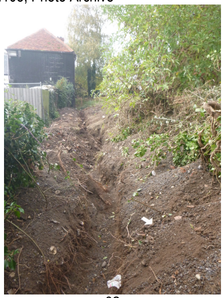
02 Gas trench, looking S