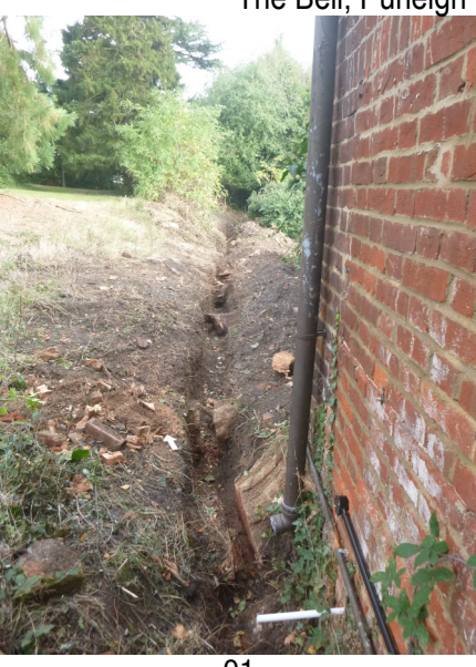
01 Gas trench, looking N