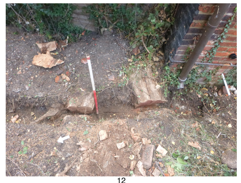
12 Gas trench showing tree root disturbance, looking E