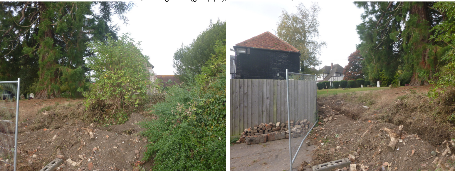
07 General site shot, looking W