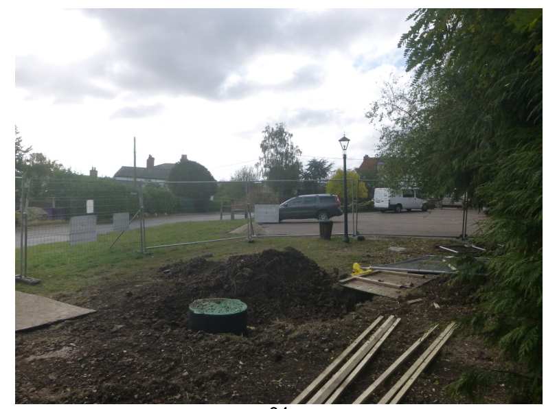
04 Gas trench, looking SE