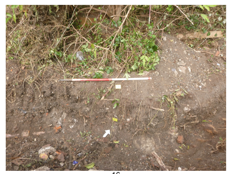
16 Representative section, looking NW