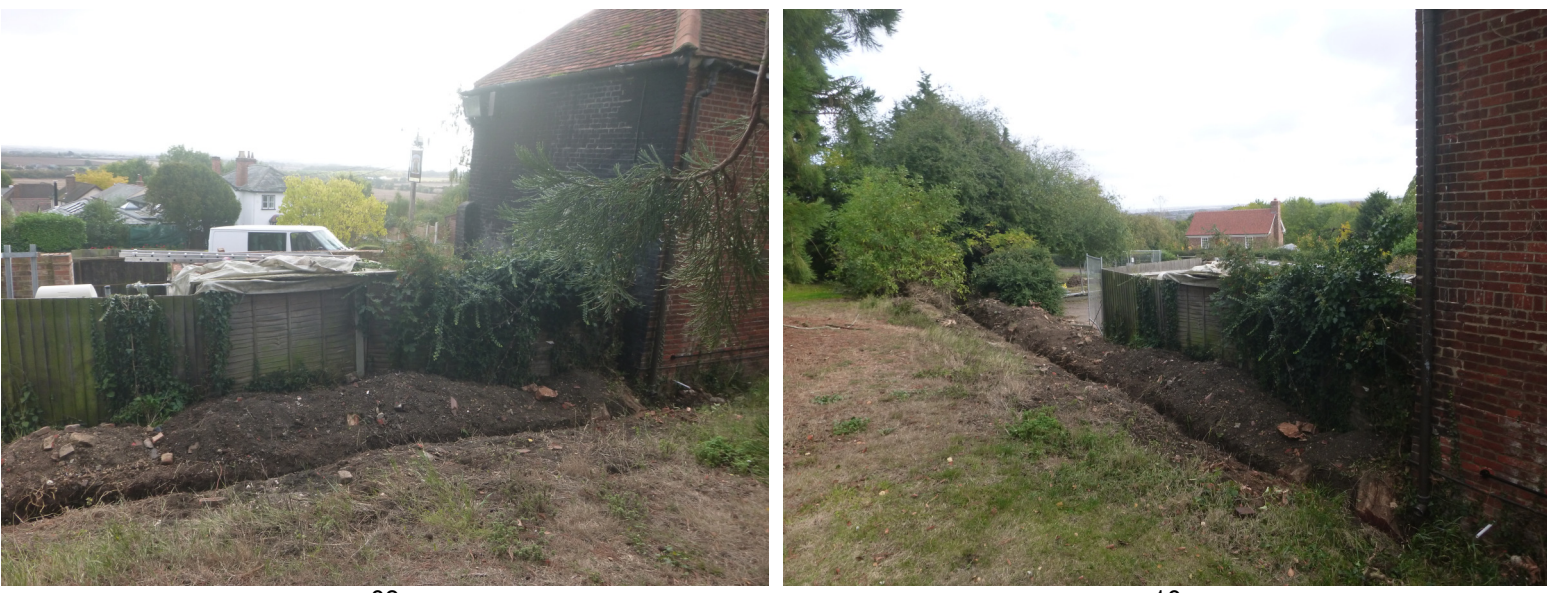
09 General site shot, looking SE