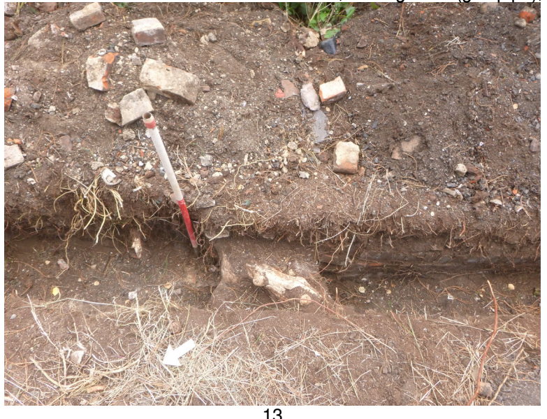
13 Gas trench showing tree root disturbance, looking E