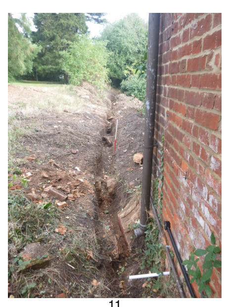
11 Gas trench, looking N