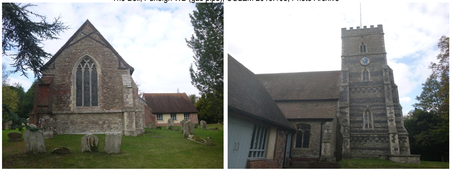
The Bell, Purleigh WB (gas pipe), COLEM 2016.108