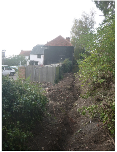
06 Gas trench, looking S