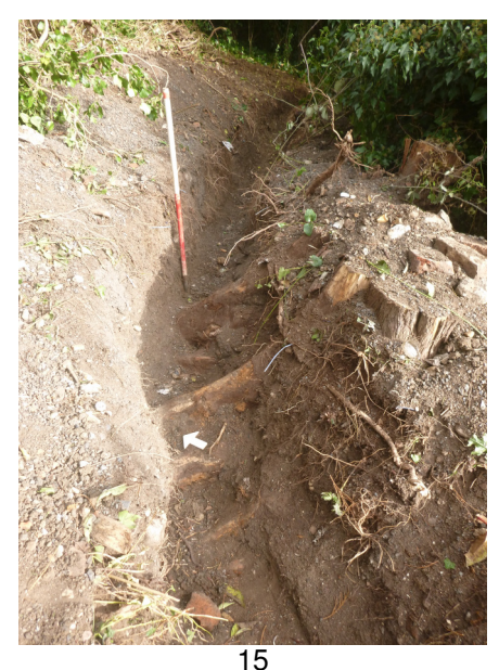
15 Gas trench showing tree root disturbance, looking NE