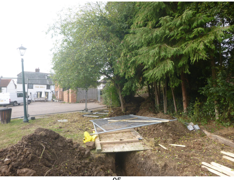
05 Gas trench, looking S