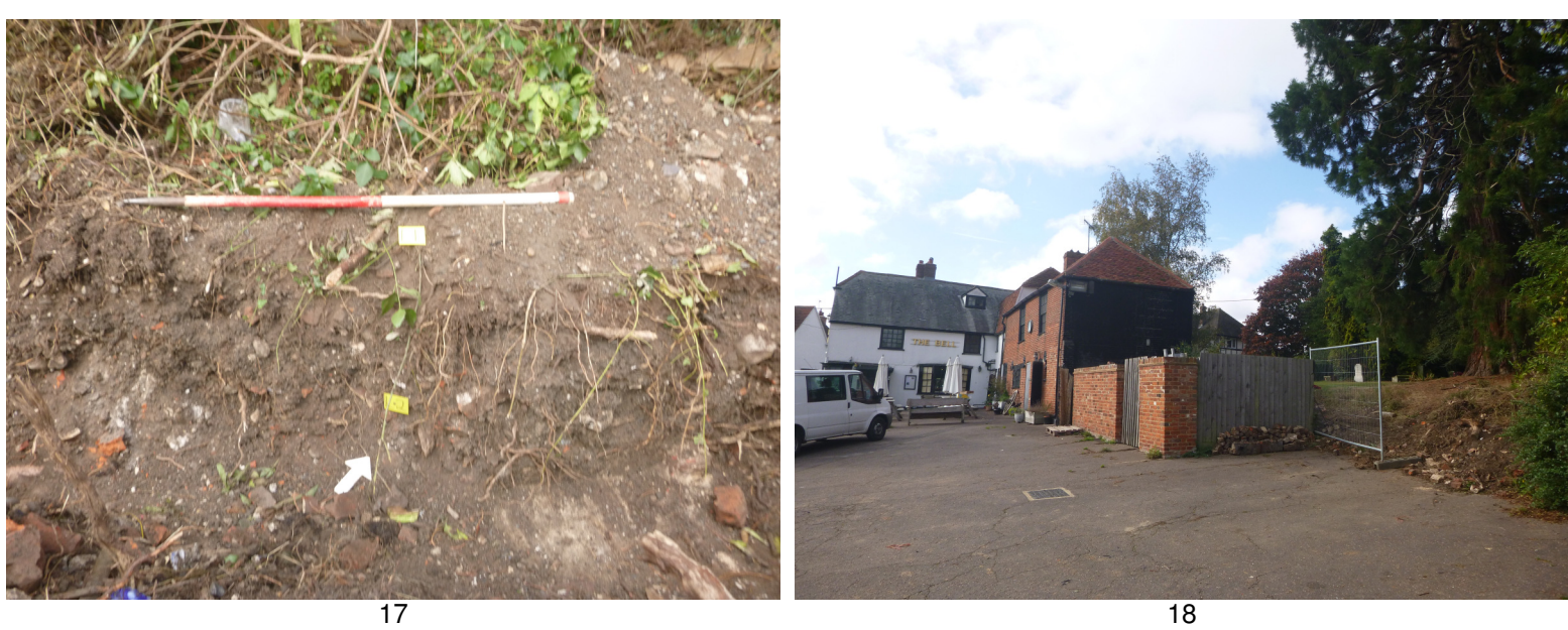
Representative section, looking NW