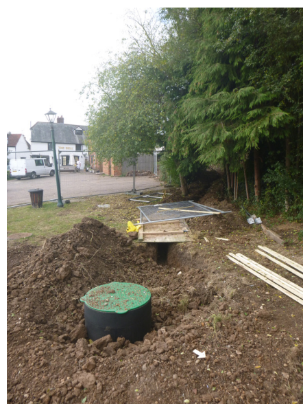
03 Gas trench, looking S