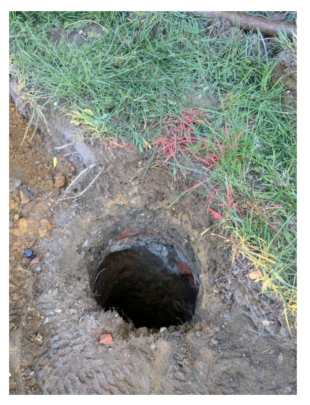
Photograph 1 Excavated hole, looking northeast

All excavations were carried out by contractors under archaeological supervision. A rectangular area measuring 0.6m by 1.2m, and 0.15m deep was dug through modern topsoil (L1). A hole measuring 0.3m x 0.5m and a further 0.7m deep was then excavated. This hole was excavated through modern topsoil (L1, 0.2m thick in total, loose dry medium grey/brown silt) onto a layer of modern backfill (L2, 0.22m thick, firm dry grey/brown silt with frequent concrete, brick, tile, stone and charcoal inclusions) which sealed a modern layer of sand (L3, soft dry medium yellow/orange and covering a service).