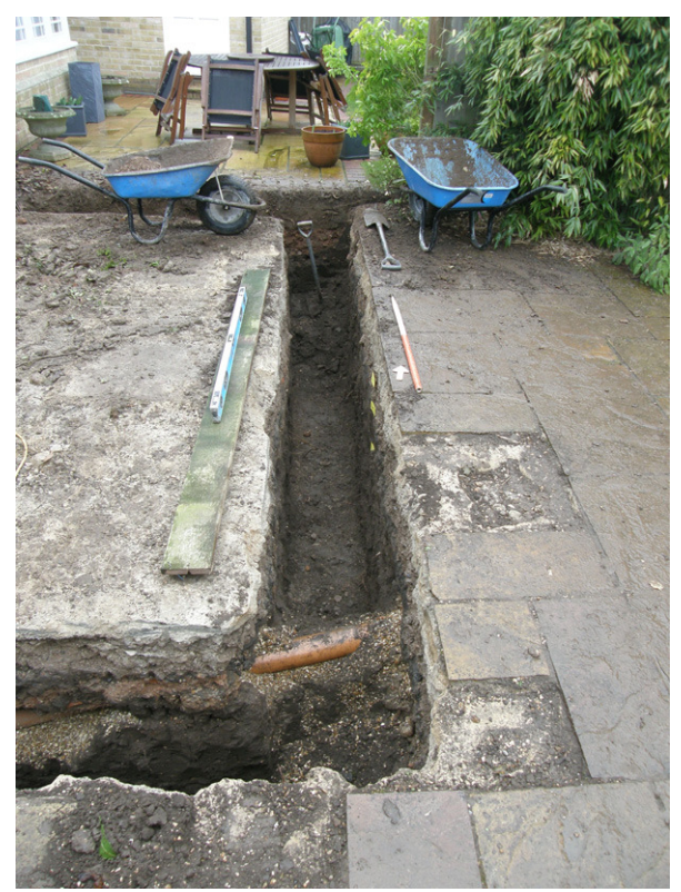
Photograph 1 Foundation trench, looking N