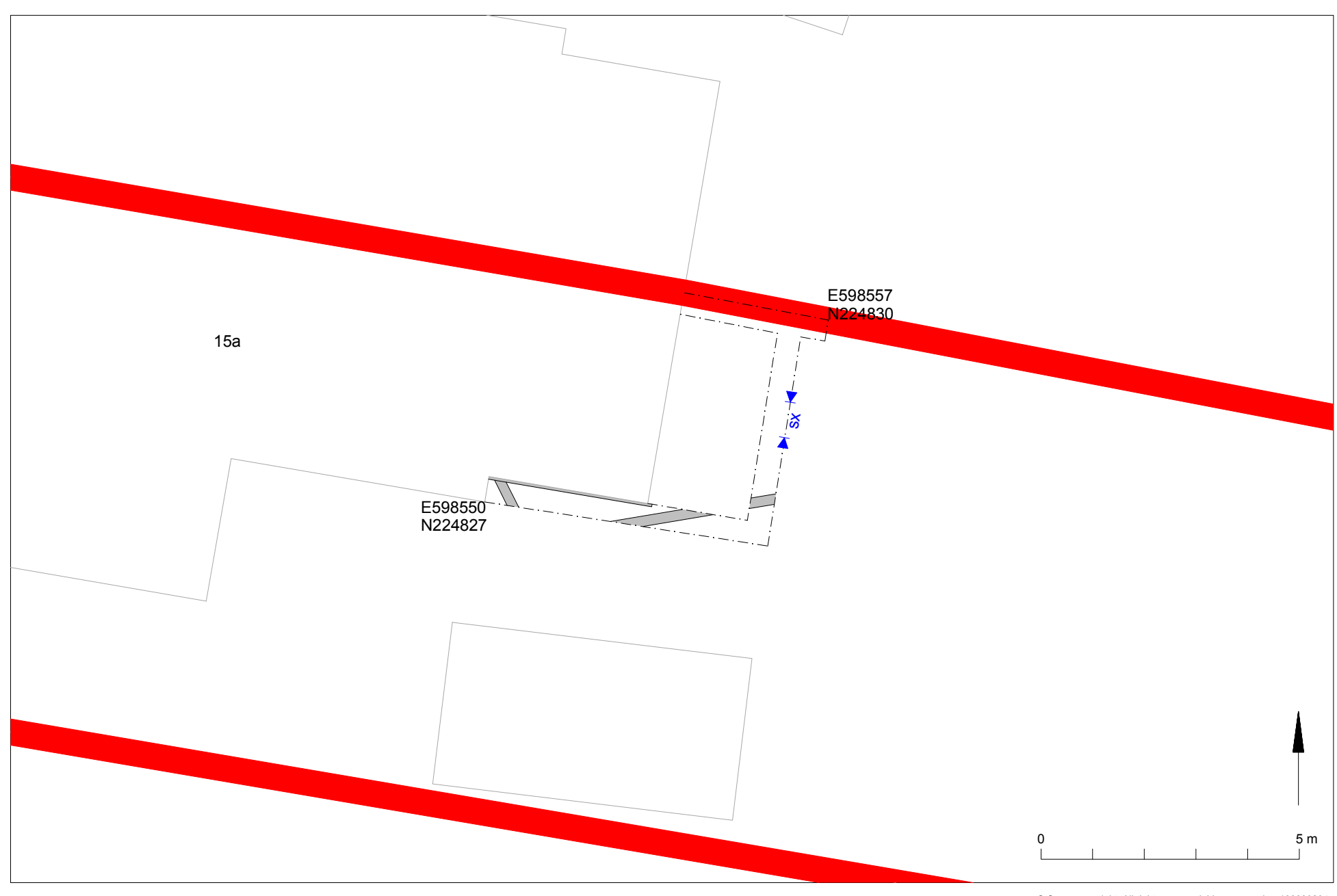
Fig 2 Results, modern services in grey