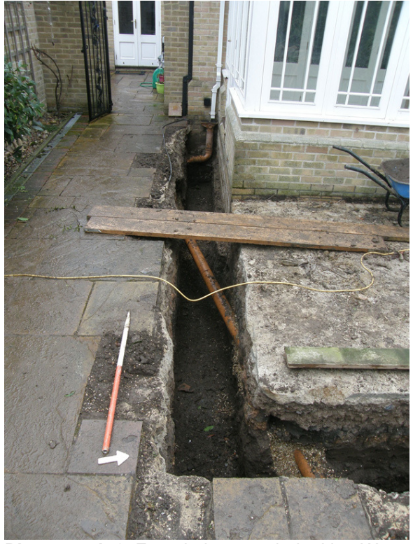
Photograph 2 Foundation trench, looking W