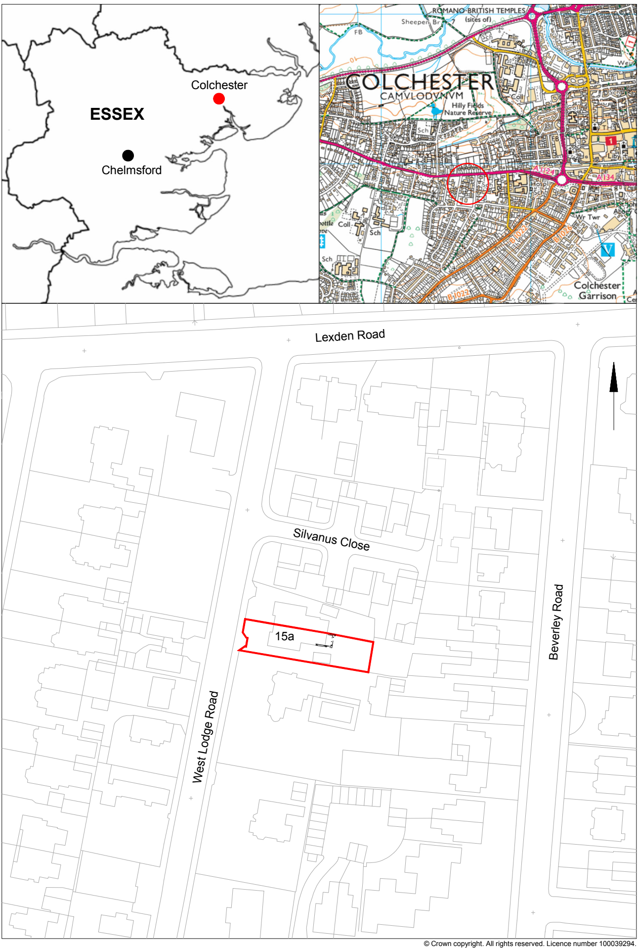
Fig 1 Site location 0 50 m