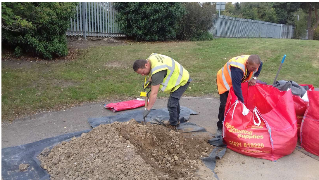
Photograph 1 Working shot

Each of the postholes was approximately 0.3m by 0.3m and, according to the contractors who carried out the work groundworks, were excavated to a depth of 0.4-0.6m. The spoil consisted of a soft, dry light/medium grey/brown silty-sand which was presumably a levelling layer underlying the tarmac surface of the playground, and so it appears that the groundworks did not penetrate beyond modern horizons.