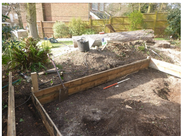
Photograph 2 Flowerbed prior to being lowered.