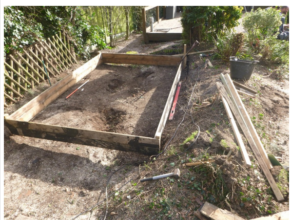
Photograph 1 Raised foundation of summerhouse visible prior to pouring of concrete. Photograph taken facing north-west. Flowerbed to be lowered visible on right. Photograph taken facing south-east.

No archaeological material or features were encountered.