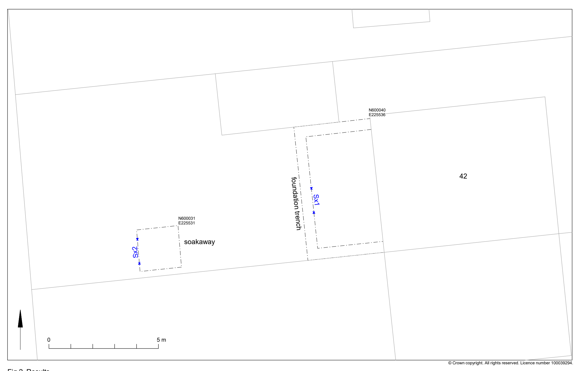
Fig 2 Results.