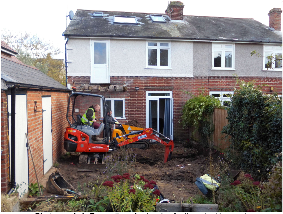
Photograph 1: Excavation of extension footings, looking east.

A total of 12m of foundation trenching was mechanically excavated to a depth of 1.3m, was 0.50m wide and a maximum of 1.3m deep. Turfed modern topsoil (L1, c 0.46m thick, soft dry/moist medium-dark brown loam) was seen on top of a make-up layer (L2, c 0.45m thick, friable dry/moist medium brown sandy silt). Under L2 was a layer of similar made ground (L3, c 0.31m thick, firm dry light/medium brown sandy silt with oyster flecks) with natural sands underneath (L4, from c 1.2m deep, dry medium yellow/orange clayey sand). L2 and L3 may be contemporary.