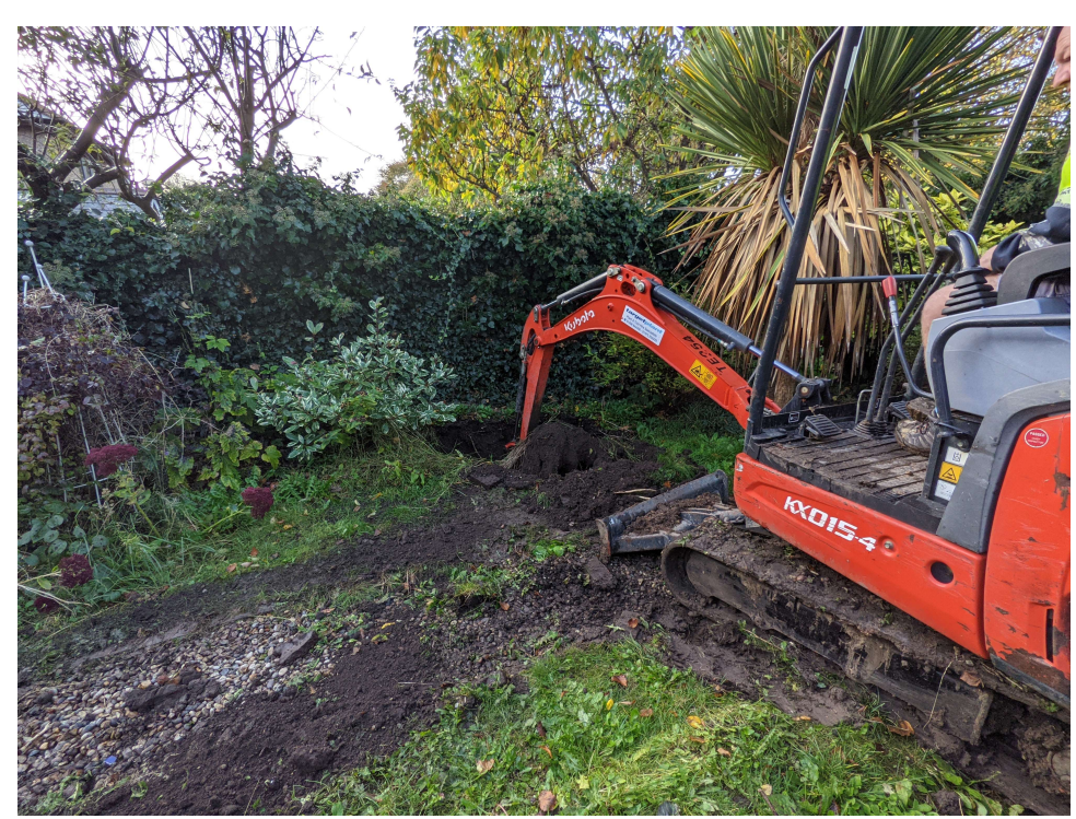
Photograph 2: Excavation of soakaway, looking south-west.

A soakaway measuring 1.9 \text{m}^2 was mechanically excavated to c 1.4m. Topsoil (L1, c 0.4m thick) sealed L2 (c 0.6m), which was on top of L3 (at least 0.45m thick). Natural (L4) was not reached in the soakaway.