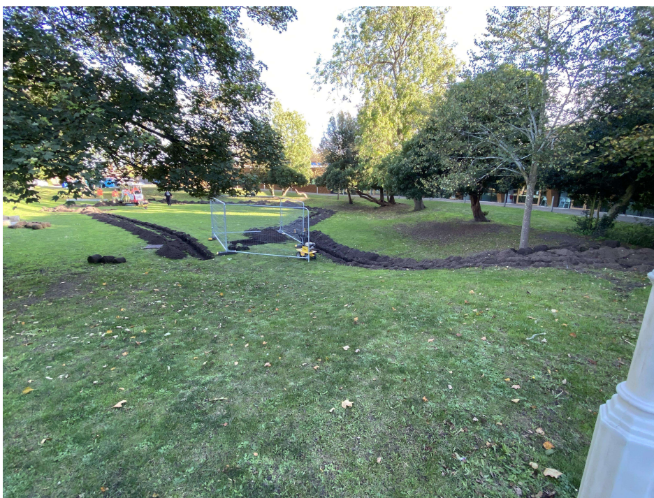
Photograph 3 General view of site from west end, looking roughly east.