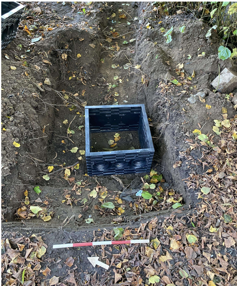
Photograph 1 Area of deeper excavation for lighting, looking north-east.

All groundworks were machine-excavated under the supervision of a CAT archaeologist. Trenches totalling c 120m in length were excavated to 0.4m wide by 0.2-0.5m deep. An area of deeper excavation on the west side of site was 1.5m by c 2m, and 0.55m deep (Photograph 1). Two layers were identified throughout. The topsoil (L1, dark grey-brown clayey silt, c 0.13m thick) sealed a similar-looking layer of medium-dark grey-brown clayey-silt (L2). Two areas of minor modern disturbance were noted in the west and south-east ends of site. These were evidenced by patches of modern orange stony sand, and tarmac-like material (Photograph 2). No significant archaeological features or horizons were impacted by the groundworks..