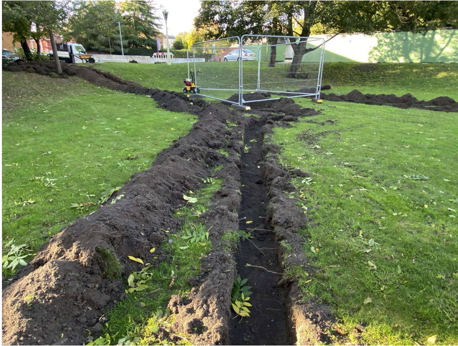
Photograph 4 General view of trenches from location of sculpture 3, looking north-west.