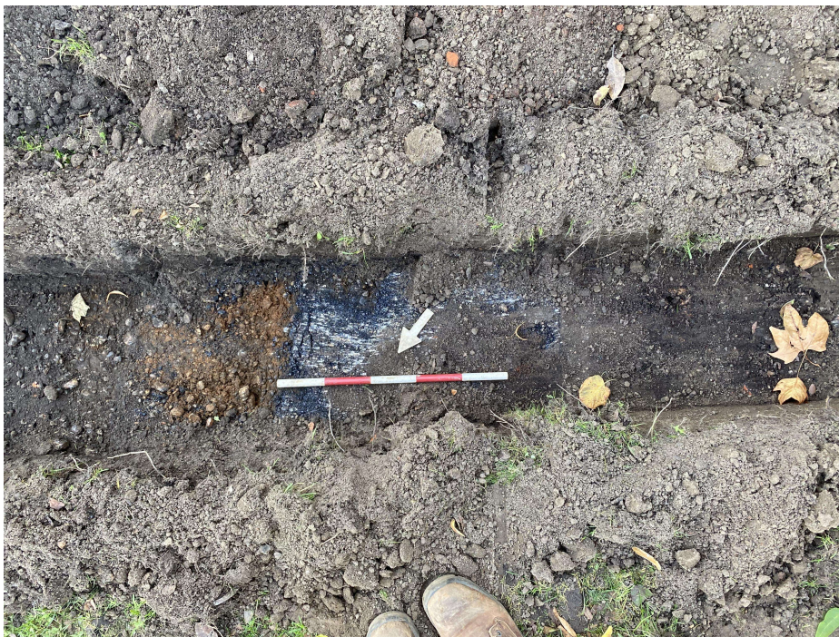
Photograph 2 A small area of modern disturbance in plan.