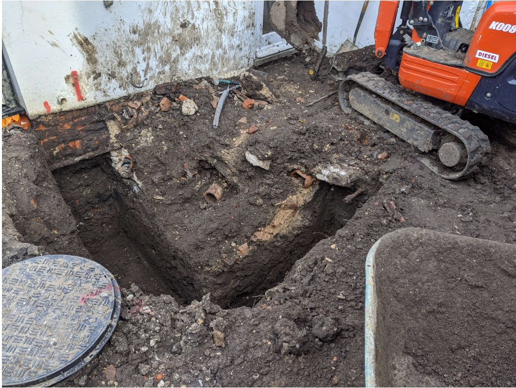
Photograph 2 Trench shot – view north-east.

Recorded by: Sarah Veasey ( sv@catuk.org ) Checked by: Philip Crummy ( pc@catuk.org )