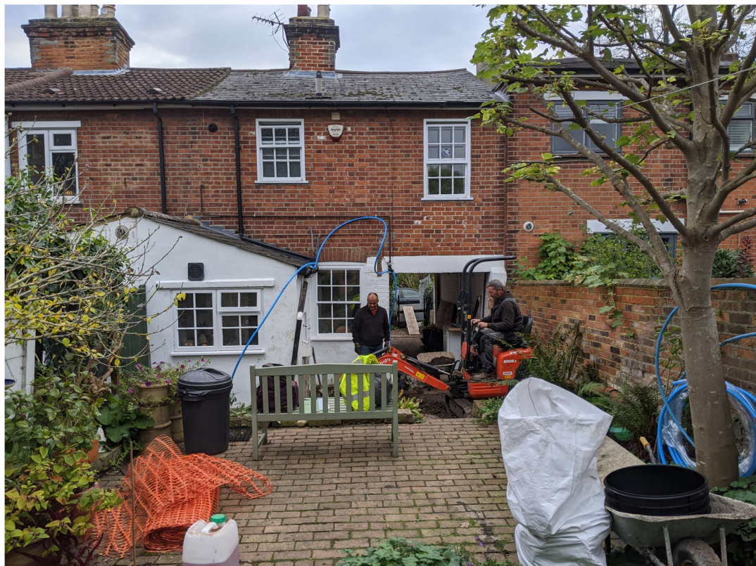
Photograph 1 Site shot – view east

An area covering approximately 2 square metres was mechanically-excavated through a make-up layer (L1, c 0.70-0.80m thick, soft, moist, dark brown loam with inclusions of brick and concrete) and into another dark silty fill (L2, c 00.70-0.80m below current ground level, soft, moist, dark grey/brown silty loam with inclusions of oyster shell, brick and tile). L2 could possibly be the fill of a large undefined feature. The trench was 0.65m wide and 1.40m deep.