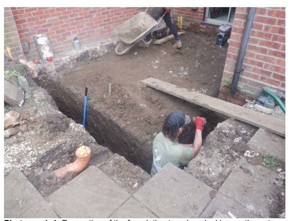
Photograph 1 Excavation of the foundation trenches, looking north-east.

away to the meet the existing wall foundation. Modern topsoil covered the site (L1, c 0.2-0.3m thick) sealing a layer of dark earth (L2, c 0.62-1.2m thick) beneath which was a layer of lighter soil (L3, c 0.25m thick to base of trench). In the northern foundation trench, there was also a layer of modern disturbance (L4, c 0.21m thick) between L1 and L2. A full context list can be found in Appendix 1.