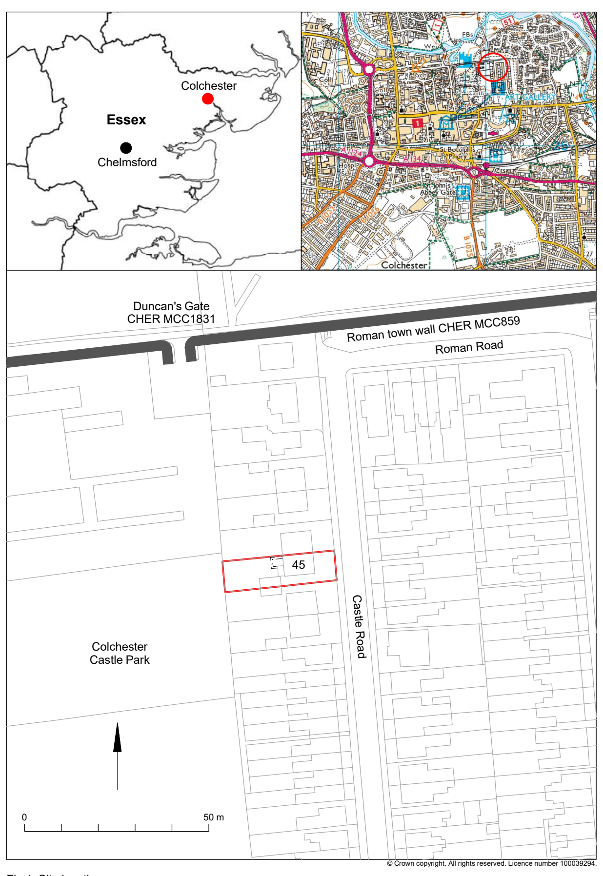
Fig 1 Site location.