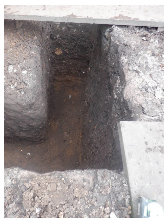
Photograph 3 Foundation trench, looking east.