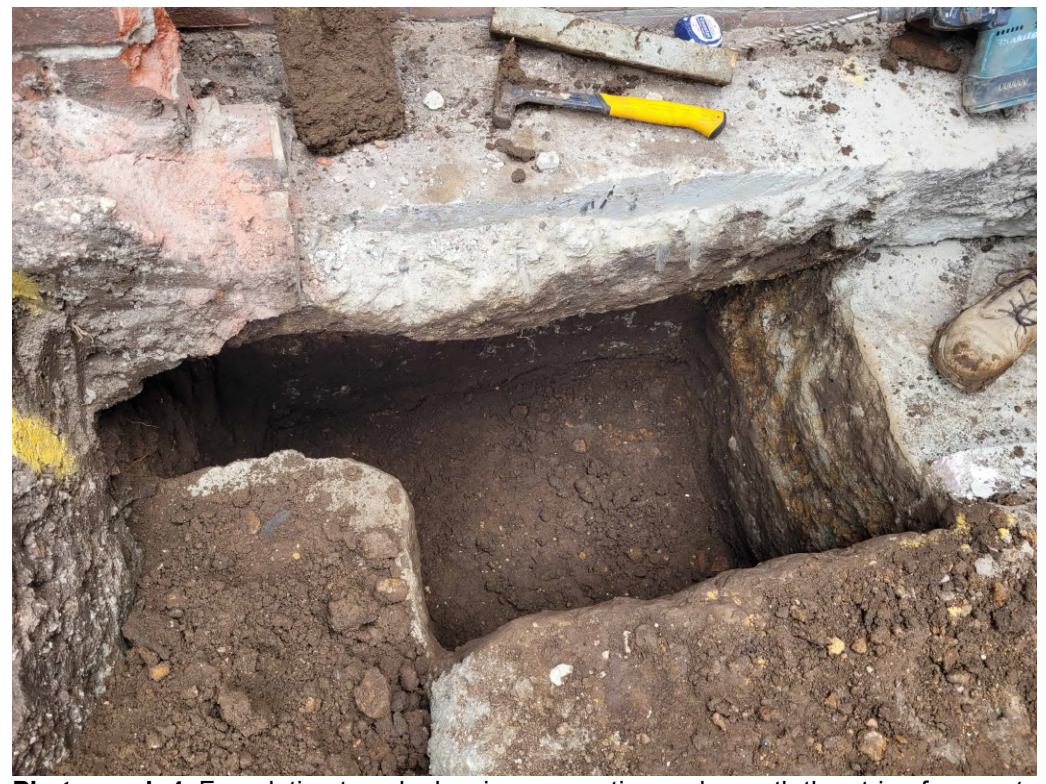
Photograph 4 Foundation trench showing excavation underneath the strip of concrete to the north of the site, looking north.