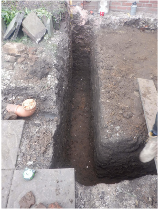
Photograph 2 Foundation trench, looking north.