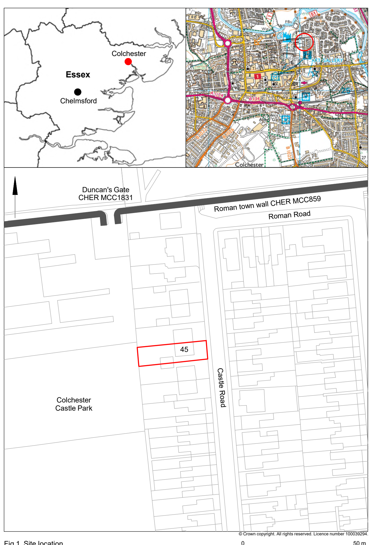
Fig 1 Site location.