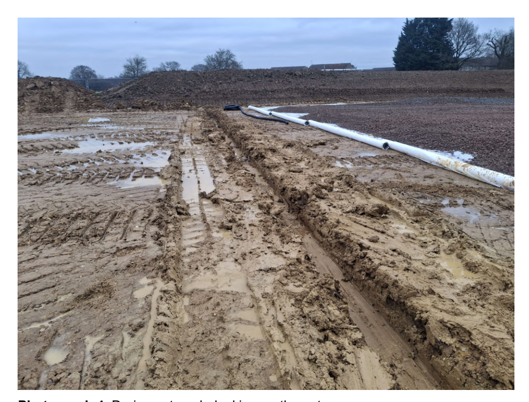
Photograph 4 Drainage trench, looking north-east.