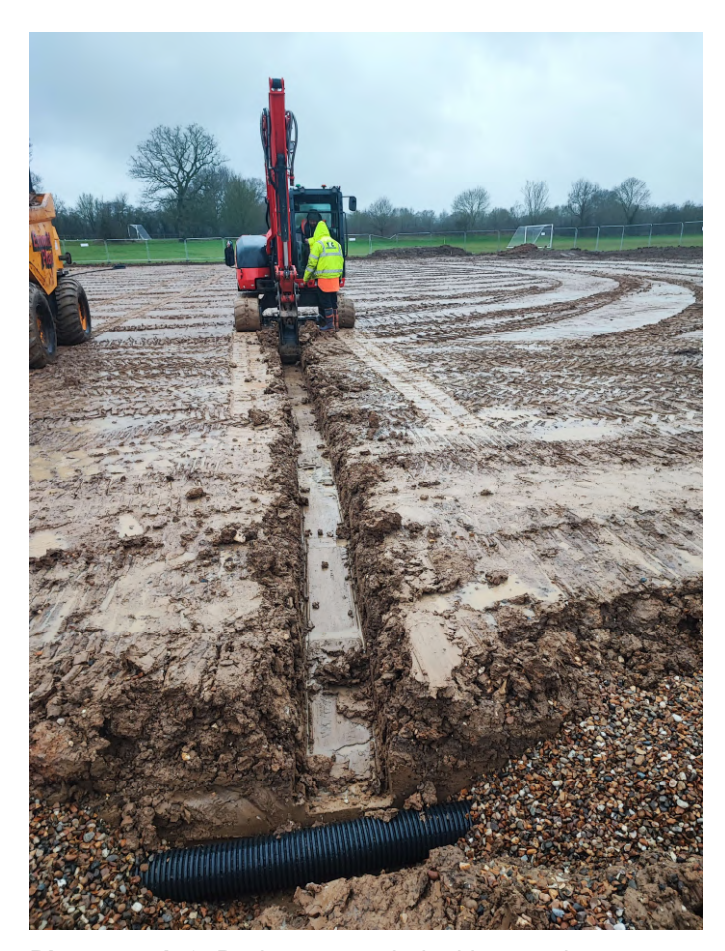
Photograph 3 Drainage trench, looking south-west.