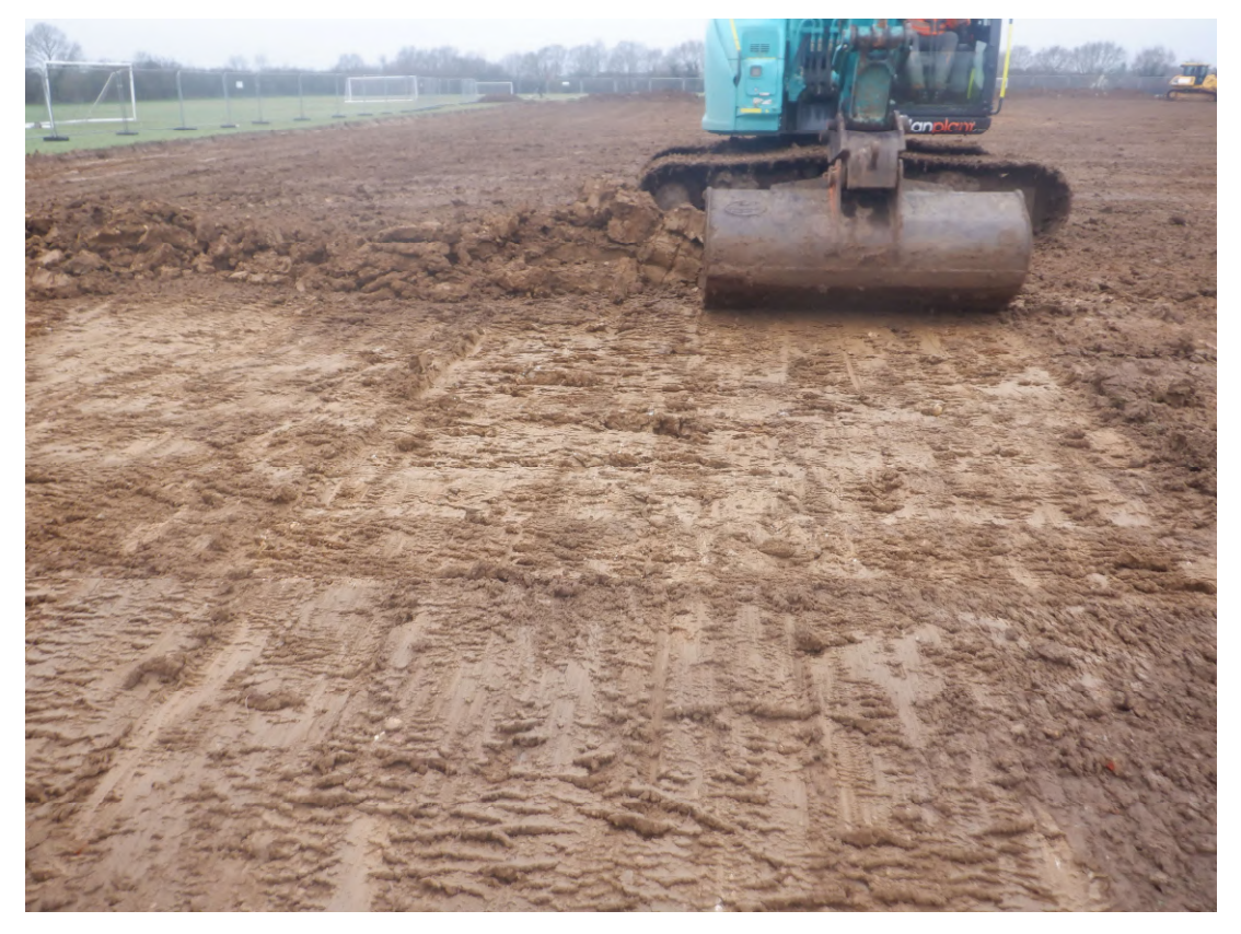
Photograph 2 Strip of the sports pitch by mechanical excavator, looking north-west.