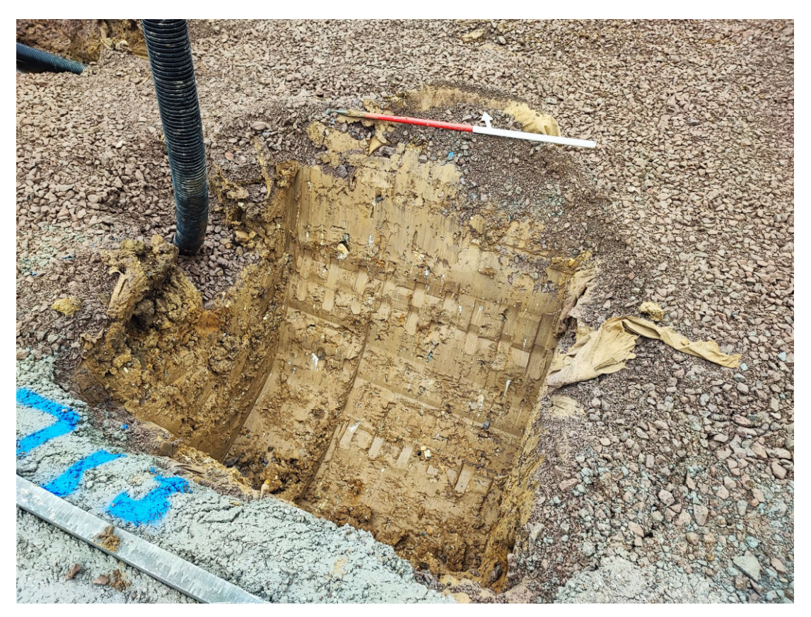
Photograph 5 Lighting pit, looking north.