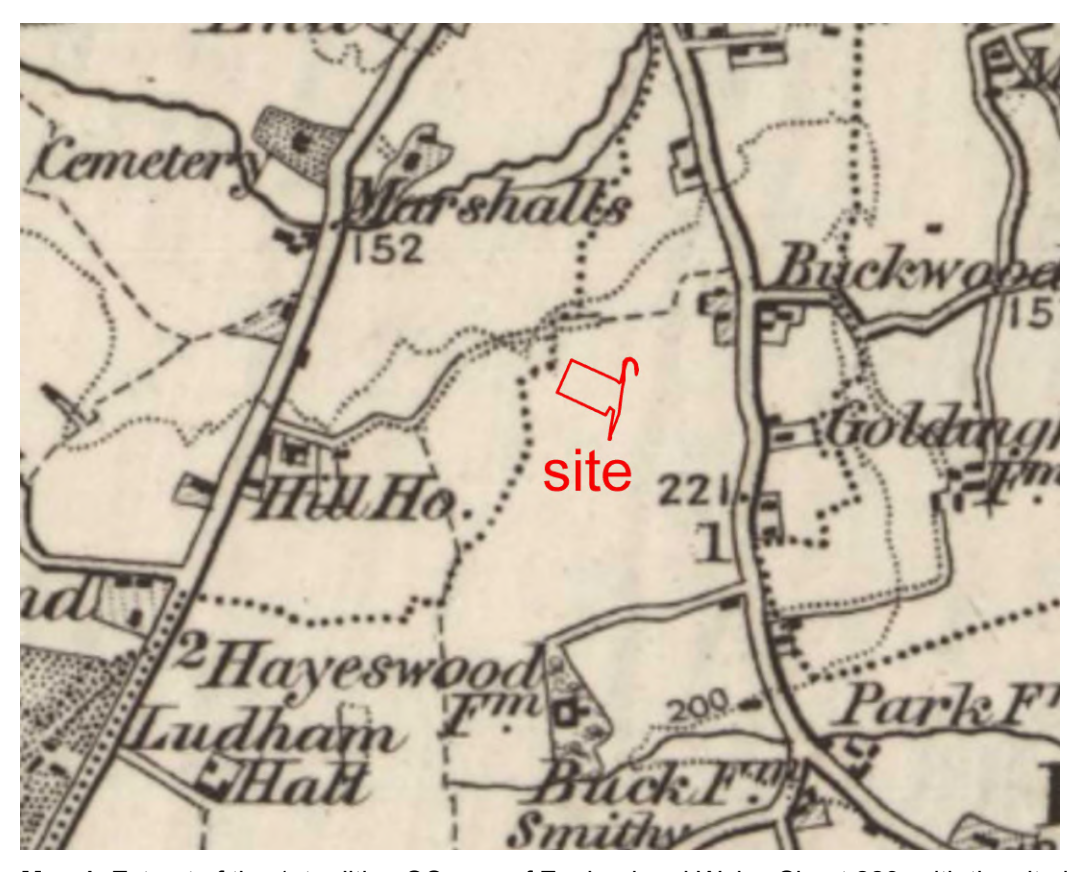
Map 1 Extract of the 1st edition OS map of England and Wales Sheet 223, with the site in red.

For a general background of Braintree, see the Braintree Historic Town Assessment Report (Medlycott 1999).