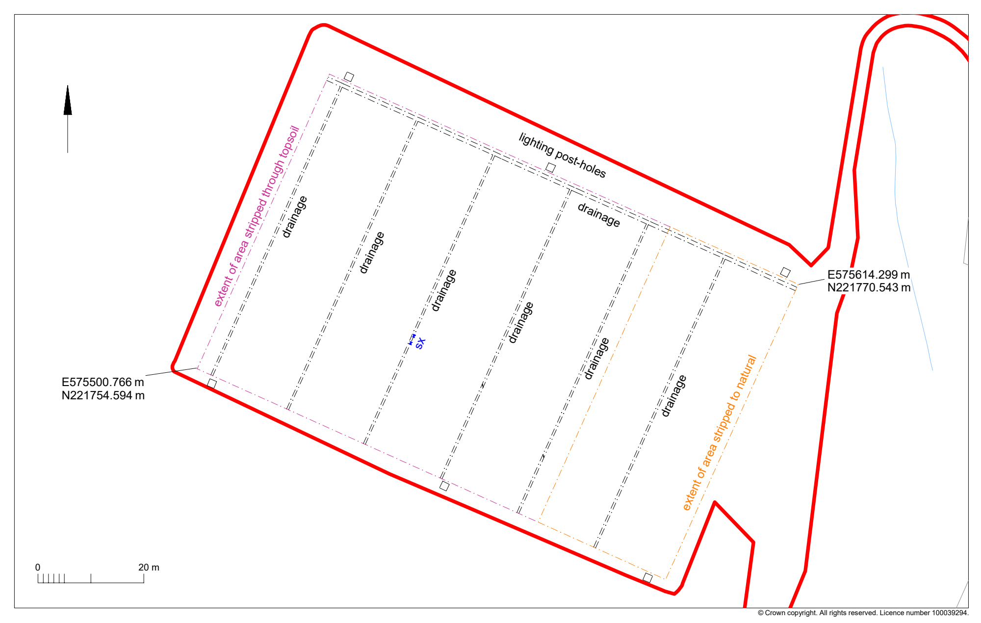
Fig 2 Results.