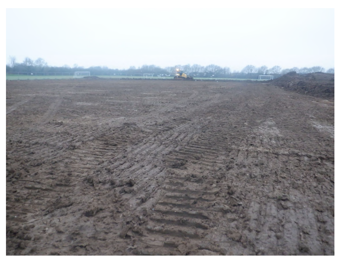
Photograph 1 Strip of the sports pitch with a bulldozer, looking north-west.